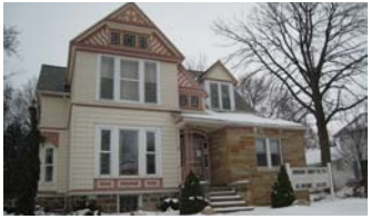
The Genealogical Library, (shown above) started its collection in 1976.

Why don't you come to Ithaca's Genealogical Library? (6) They have information from the basement to the 2 nd floor.