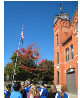
The tall tower is where they hung the hoses to drain in the 1900's

Ithaca's Fire Hall (5) has been stopping fires since 1894. There is an old Village Hall room upstairs; you can see a vault that held the city's money. Also firefighters stayed upstairs, but only three at once. Be sure to look up to the rare Fireman Weathervane at the top!