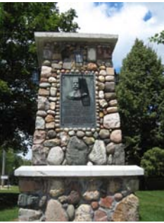
Historic stones and stories make this memorial.