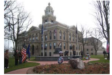
Above: Current Courthouse with the All War's Memorial