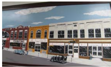
Above: This mural is 18 feet long and 2 feet tall.

Come see a fascinating mural (2) that shows how Ithaca's downtown changed through time. Mr.